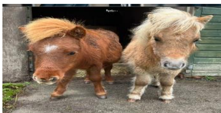
Peanut & Wizzle Miniature Shetland Ponies

AS OF JUNE, HILL HOUSE WILL HAVE THE VAN AVAILABLE FOR RESIDENT OUTINGS ON TUESDAYS, WEDNESDAYS & THURSDAYS.